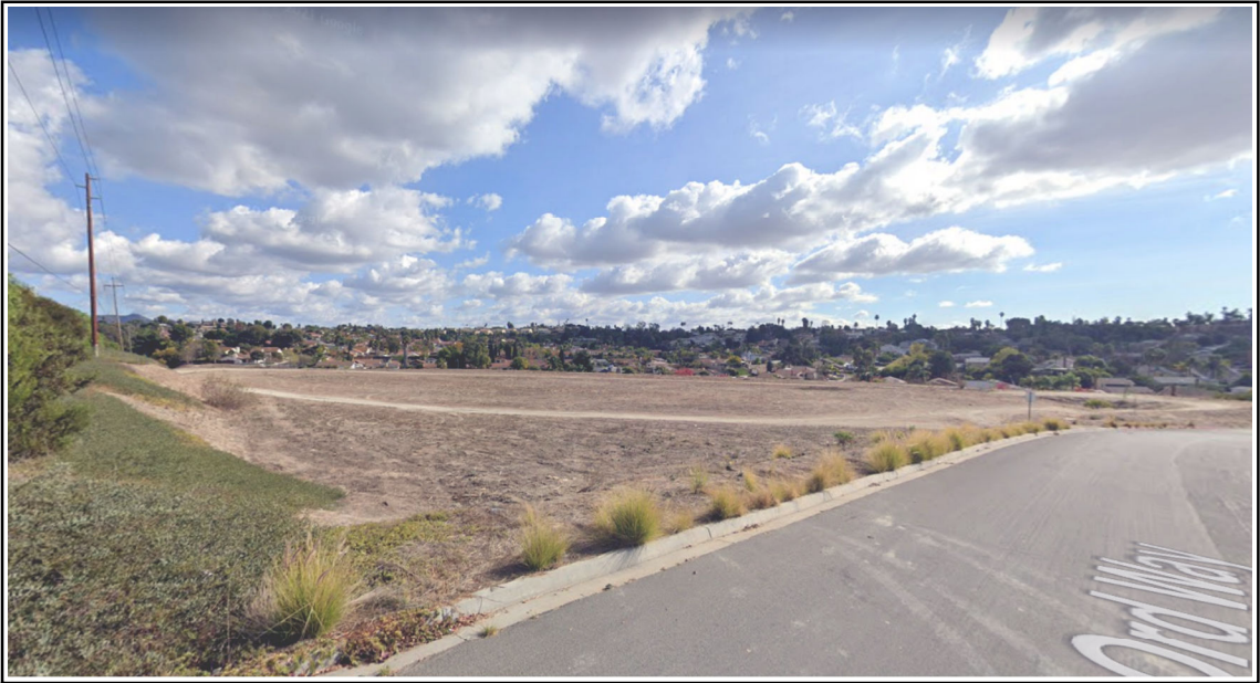
A. Photograph looking towards the southeast from Ord Way.