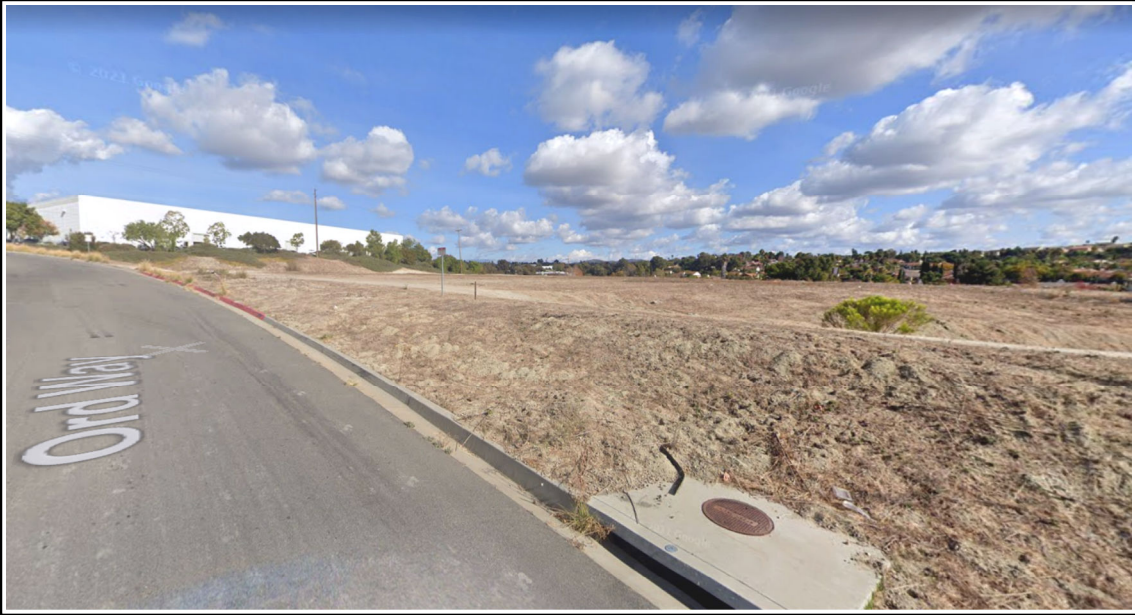
B. Photograph looking towards the southeast from Ord Way.