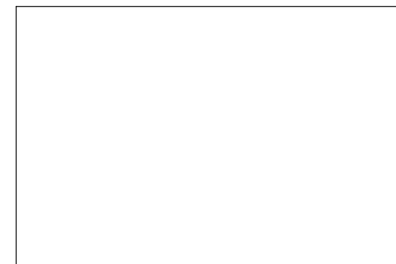
VICINITY MAP SCALE: